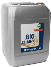
X-GUARD BIO CHAIN OIL | 20 LITRE 596 45 73-04