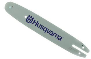
GUIDE BAR 12" 1/4" .050" 64DL MINI BAR MOUNT (A318) 575 84 22-64