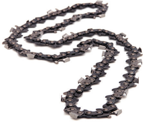
CHAIN LOOP 1/4" .050" MICRO- CHISEL H00-64DL 501 84 40-64