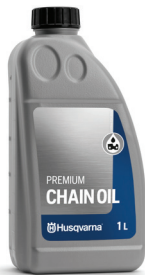
MINERAL BAR & CHAIN OIL - 1 LITRE 579 39 60-01