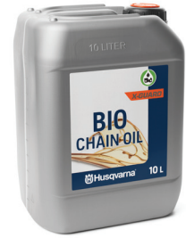
X-GUARD BIO CHAIN OIL | 10 LITRE 596 45 73-03