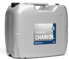
MINERAL BAR & CHAIN OIL - 20 LITRE 579 39 62-01