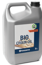
X-GUARD BIO CHAIN OIL | 5 LITRE 596 45 73-02