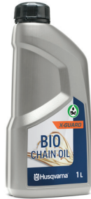
X-GUARD BIO CHAIN OIL | 1 LITRE 596 45 73-01