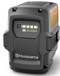
BLI200X BATTERY 970 44 89-01