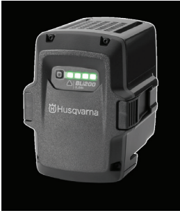
BLI200 BATTERY 967 09 19-01