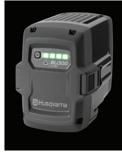
BATTERY BLI300 967 07 19-01