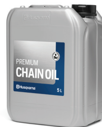
MINERAL BAR & CHAIN OIL - 5 LITRE 579 39 61-01